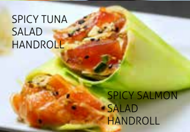
SPICY SALMON SALAD HANDROLL