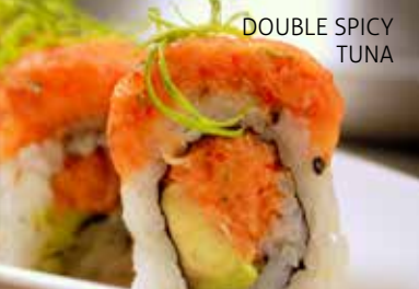
DOUBLE SPICY TUNA