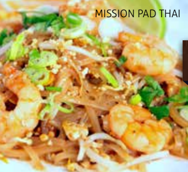
MISSION PAD THAI