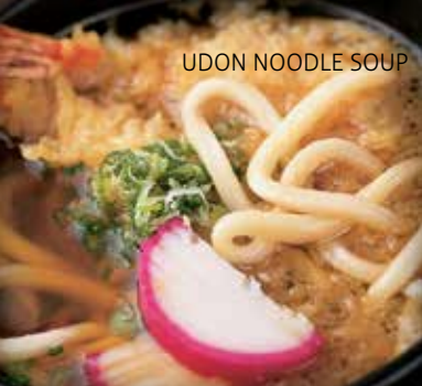
VEGETARIAN NOODLE SOUP