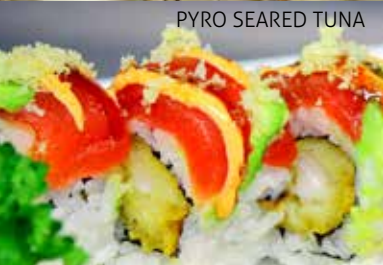
PYRO SEARED TUNA