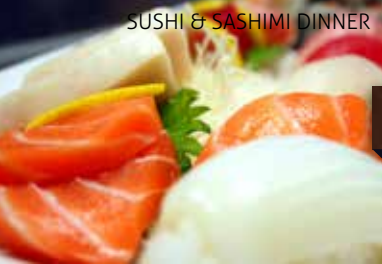
SALMON &amp; TUNA SUSHI